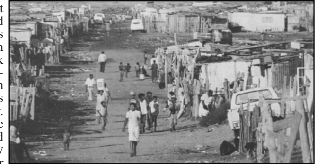
A black township in New Brighton

Police could, at any time, demand to see a person's pass book, even entering black homes. Non-compliance with the race laws was dealt with harshly. Violation of the race laws could mean a lengthy imprisonment, or much worse.