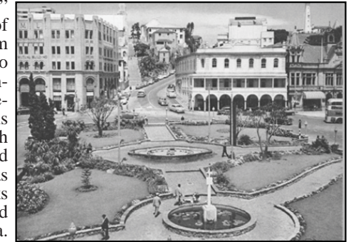
The Mayor's Garden in Port Elizabeth

Race laws extended to all aspects of South African social life, including the prohibition of marriage between whites and non-whites, the government sanctioning of "whites-only" jobs, and the forced removal of millions of black Africans from their homes and communities into segregated "locations" or townships. In 1951, the Bantu Homelands Act declared these locations independent nations from South Africa and in so doing, stripped black Africans of their rights as South African citizens. Blacks were from then on considered foreigners in white South Africa.