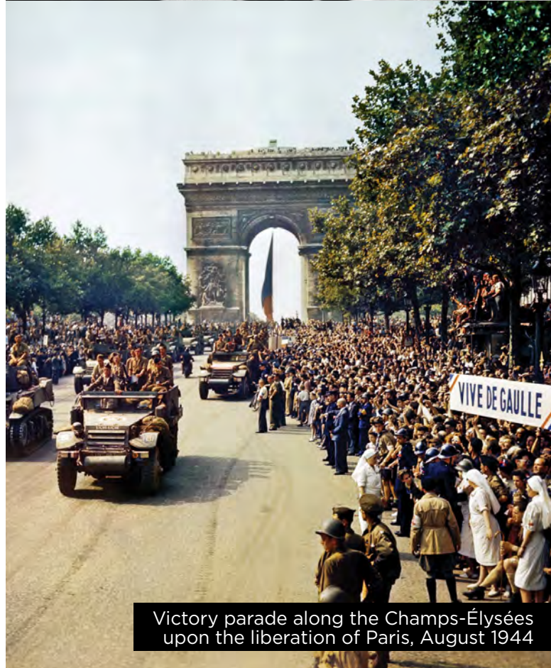
Victory parade along the Champs-Élysées upon the liberation of Paris, August 1944