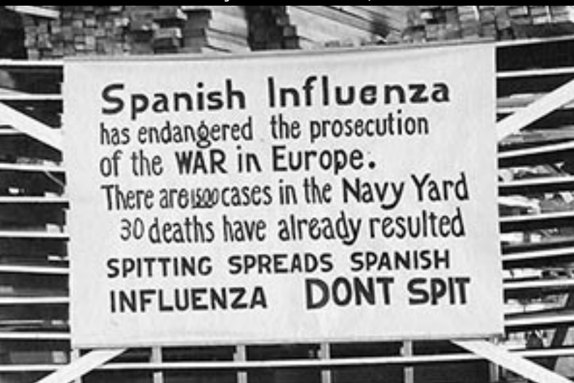
A sign posted at Philadelphia’s Naval Aircraft Factory on October 19, 1918