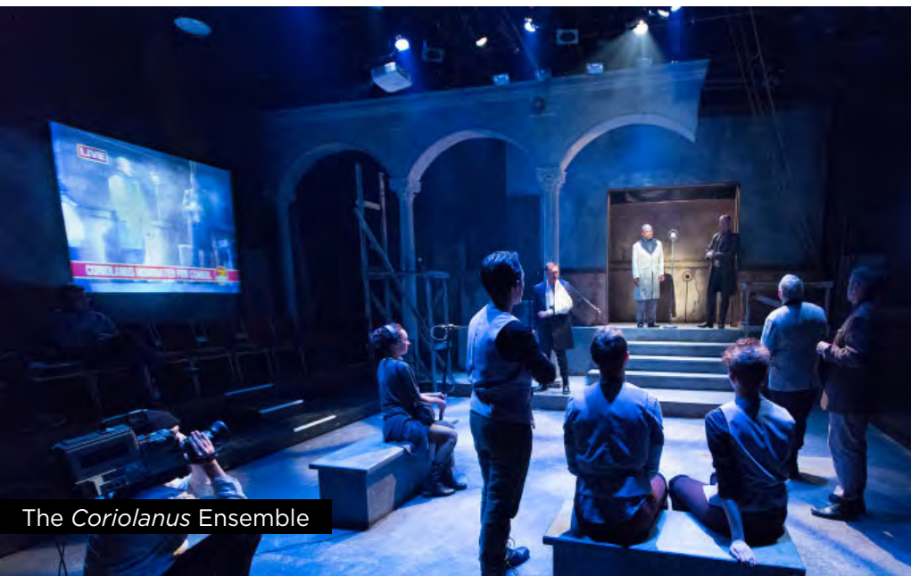
The Coriolanus Ensemble