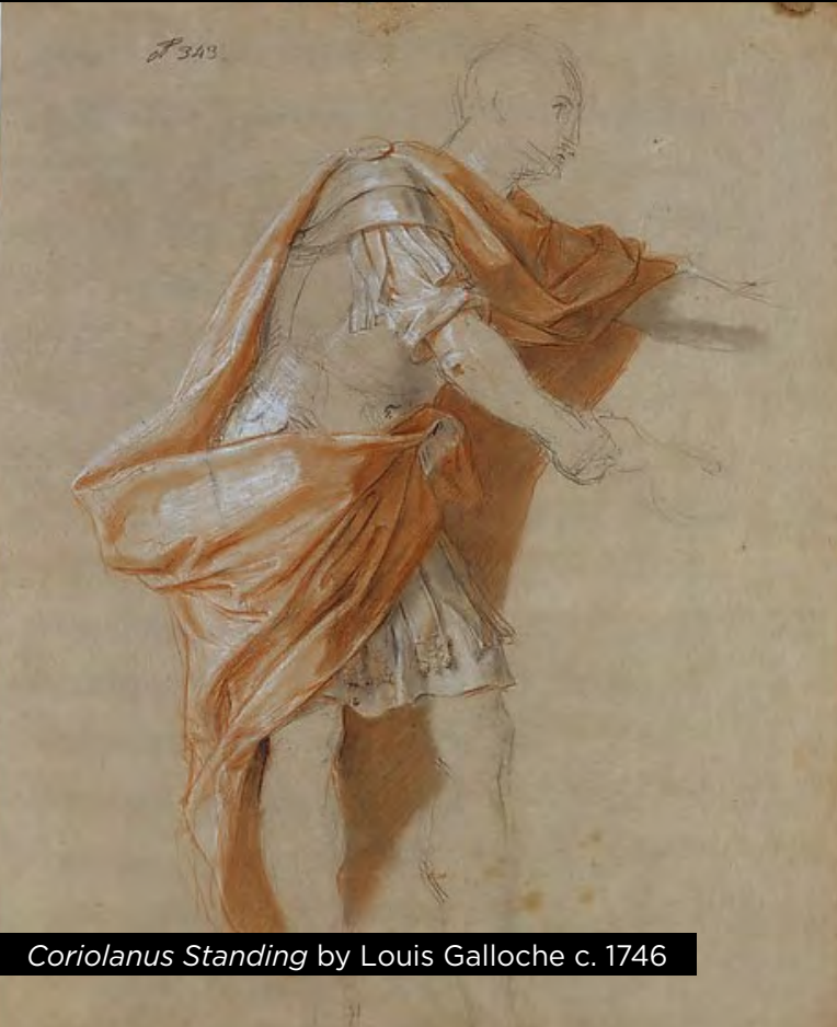
Coriolanus Standing by Louis Galloche c. 1746

Much of the conflict in Coriolanus arises from tensions between the noble class (patricians) and the common people (plebeians). Wealth and political power were disproportionately concentrated with the patricians and were handed down dynastically. At the birth of the Roman Republic, only patricians could govern, leaving the much larger class of plebeians without an effective means to make change politically. Coriolanus' Rome, a republic barely 15 years old, is a city in upheaval; the plebeians have recognized the power imbalance in their highly stratified society and are rebelling against it, demanding to be heard.