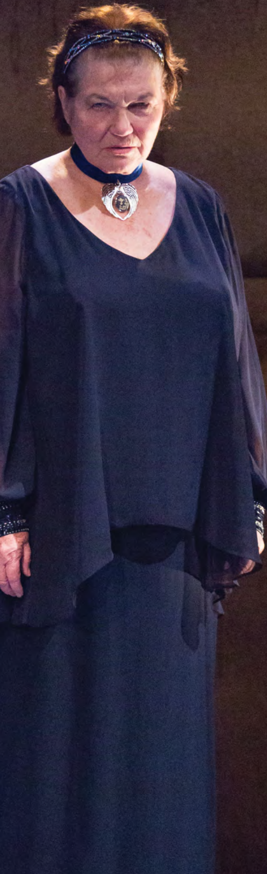
Tina Packer as Volumnia