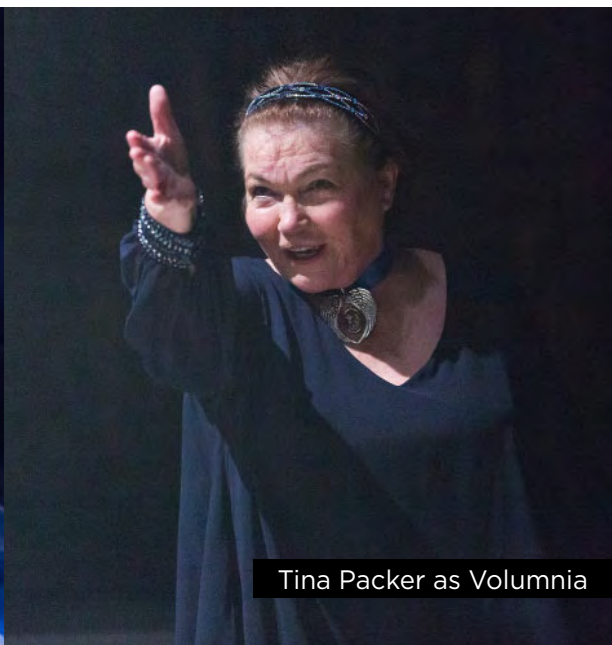
Tina Packer as Volumnia