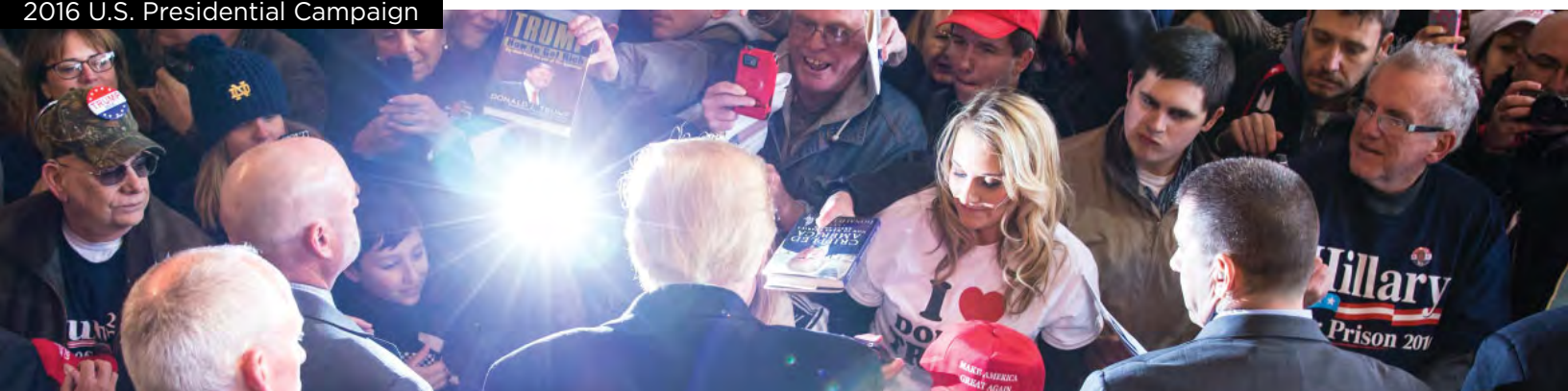
2016 U.S. Presidential Campaign