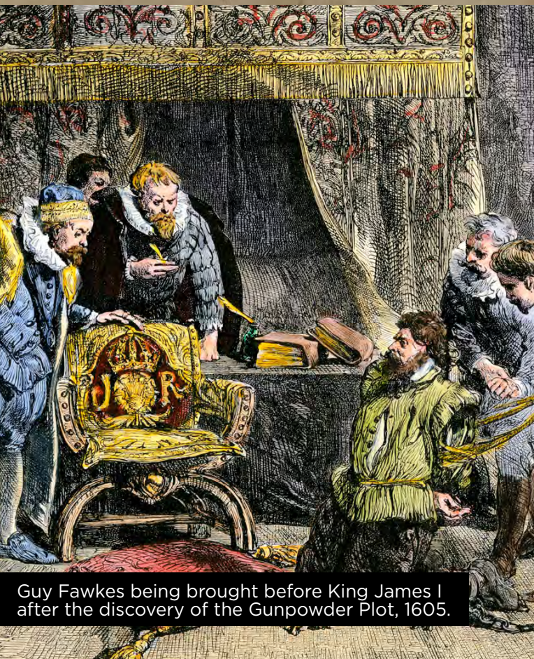
Guy Fawkes being brought before King James I after the discovery of the Gunpowder Plot, 1605.

Much of the conflict in Coriolanus arises from tensions between the noble class (patricians) and the common people (plebeians). Wealth and political power were disproportionately concentrated with the patricians and were handed down dynastically. At the birth of the Roman Republic, only patricians could govern, leaving the much larger class of plebeians without an effective means to make change politically. Coriolanus' Rome, a republic barely 15 years old, is a city in upheaval; the plebeians have recognized the power imbalance in their highly stratified society and are rebelling against it, demanding to be heard.