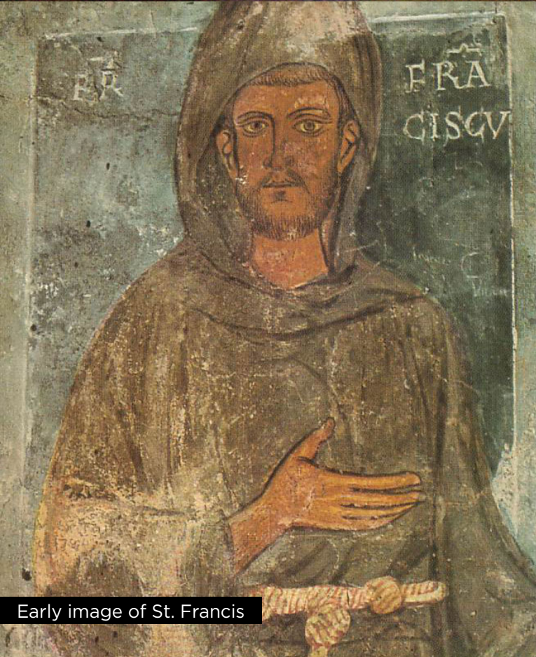
Early image of St. Francis

reign, and this willingness to fold some Catholic traditions, language, and practice into Church of England policy angered the Puritans that sought to purify the church. Angelo's inflexibility might find its roots in these fundamentalist leanings.