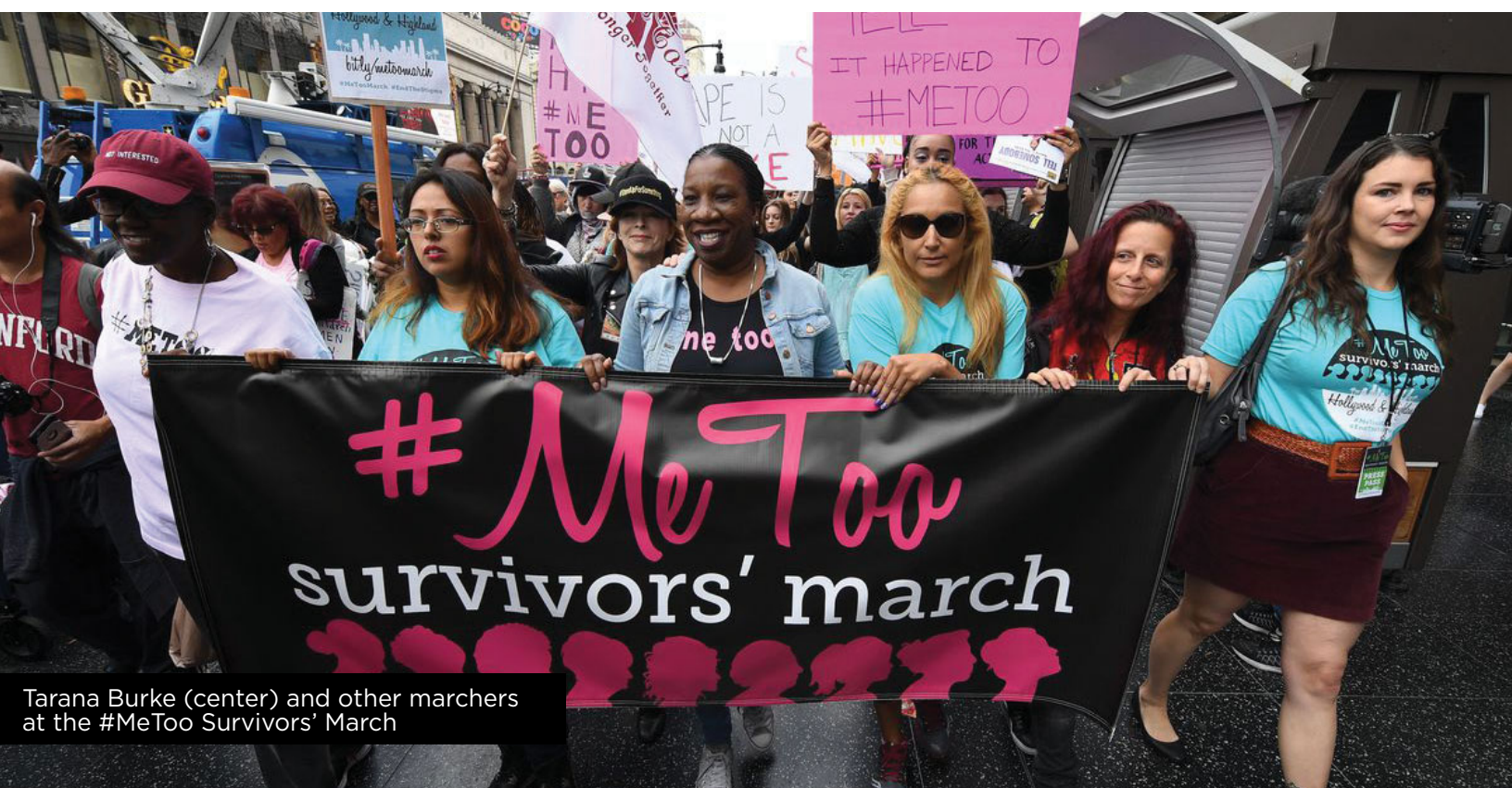
Tarana Burke (center) and other marchers at the #MeToo Survivors' March