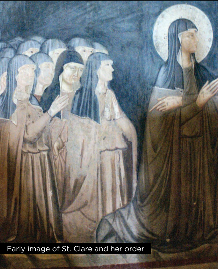
Early image of St. Clare and her order