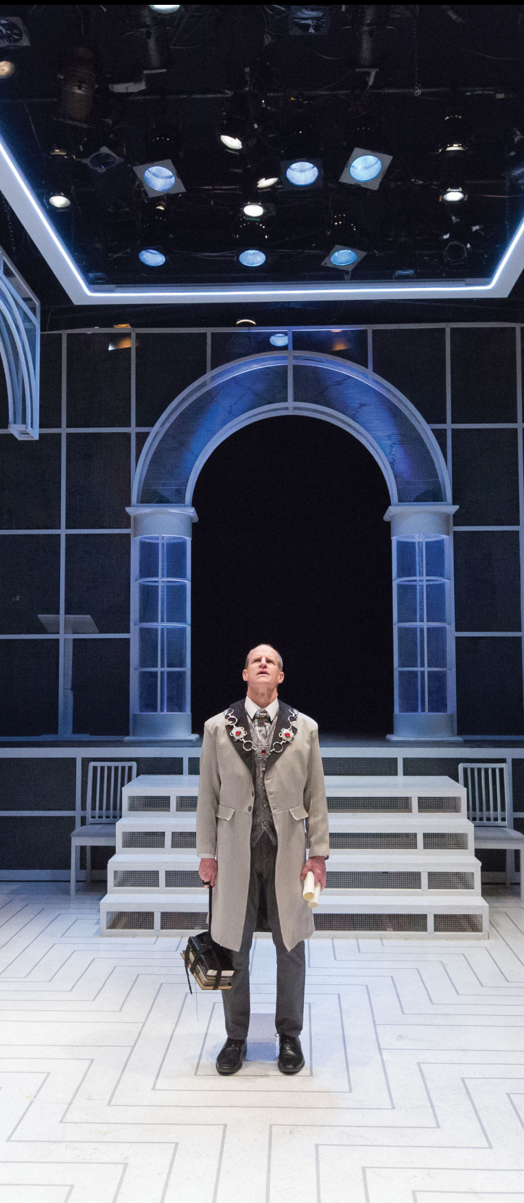
TABLE OF CONTENTS 2